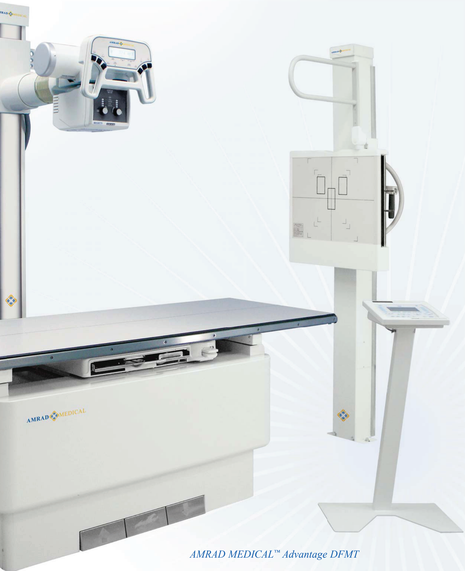
AMRAD MEDICAL™ Advantage DFMT