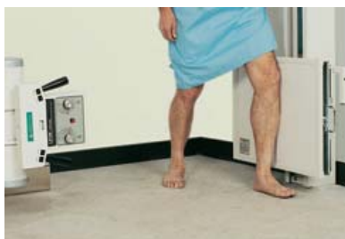
The extended tube travel eliminates the need for a platform during weight-bearing procedures.