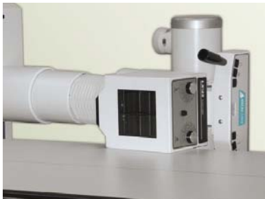
Cross-table procedures can be easily accomplished by the rotational tubestand and optional tube trunnion rings.